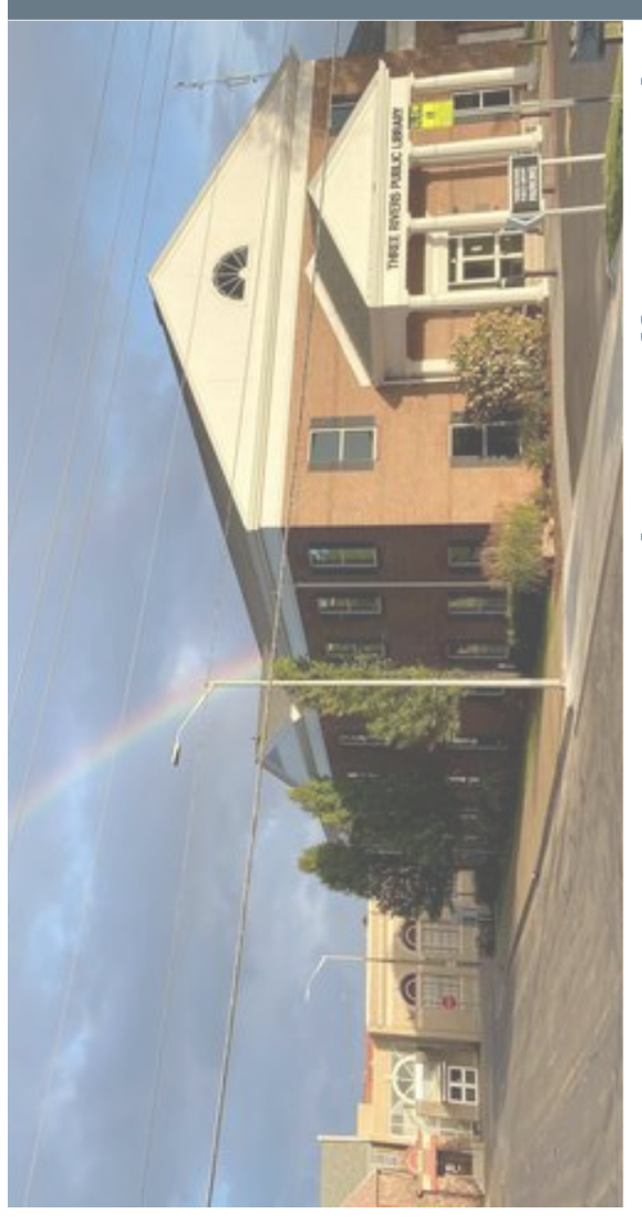
Library staff can provide